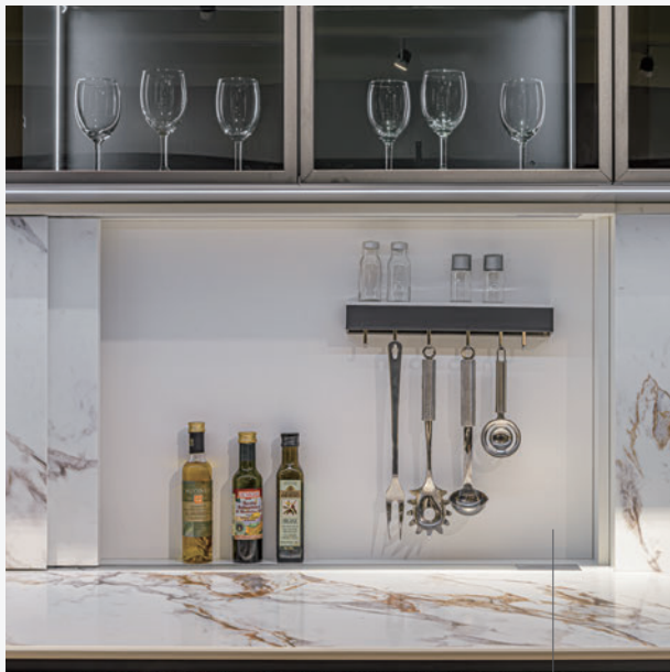
Magnetic kitchen panel