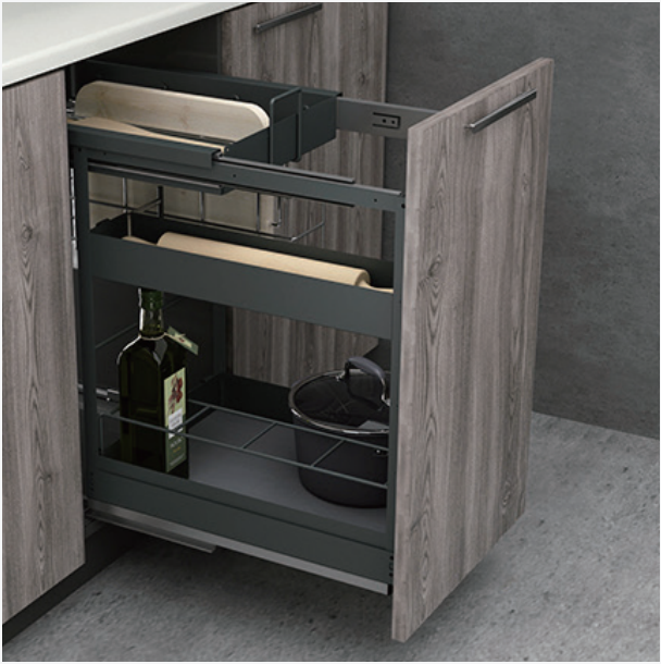
Bottle Holder & Chopping Board Storage