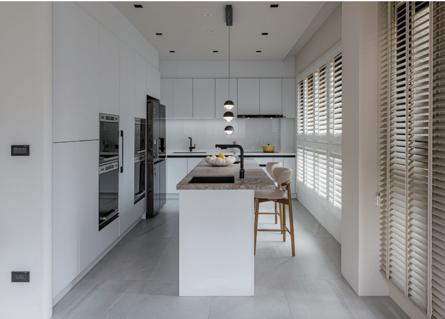
Kitchen Design | HChen Jing-Sheng Photography | Katoh Photography Studio Main Style | Modern