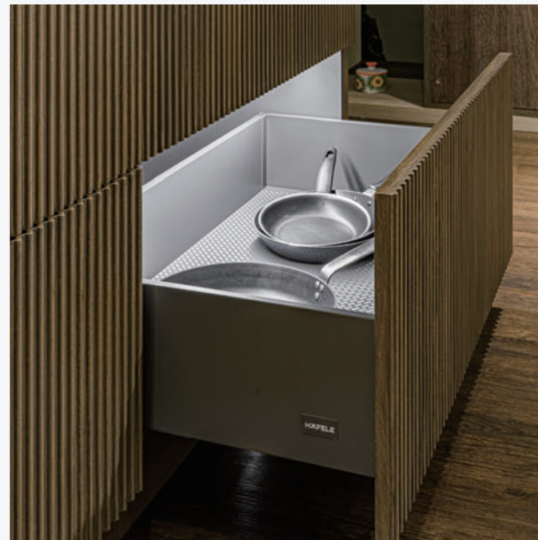
Matrix Slimwall Drawer Systems - Hafele