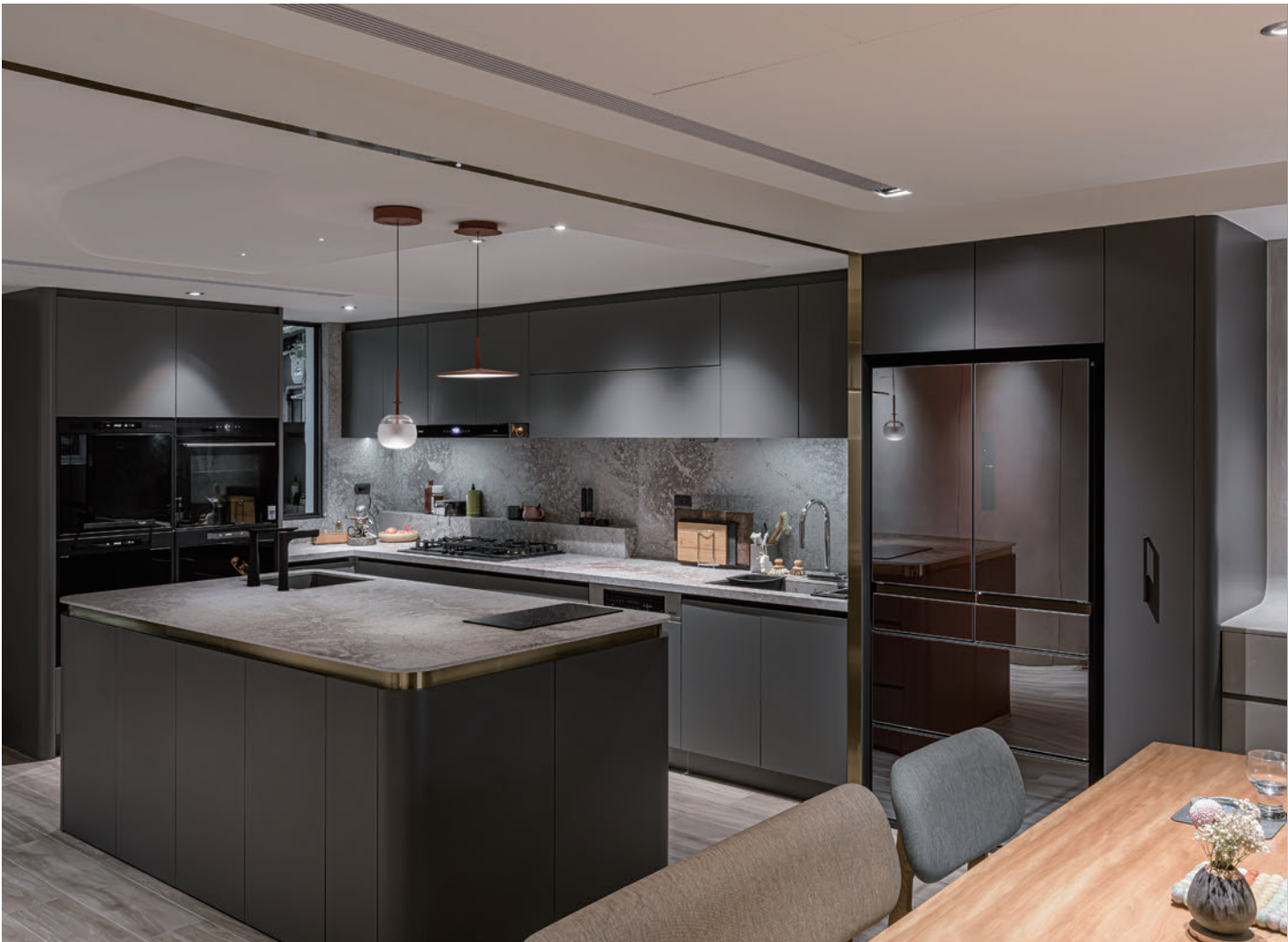
Kitchen Design | Huang Zun-Yi Photography | Katoh Photography Studio Main Style | Modern

We provide you with high-quality kitchen design proposals.