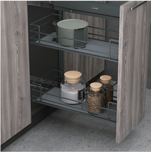
Side-mounted Pull Out Kit