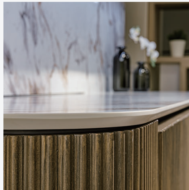
Fluted Solid Wood Door