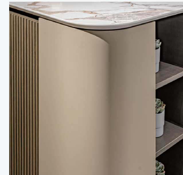
Curved Cabinet Door