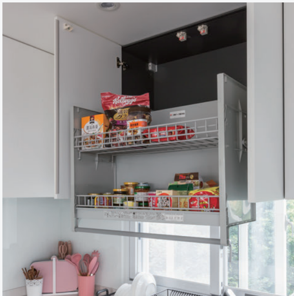
Pull-Down Storage Kit