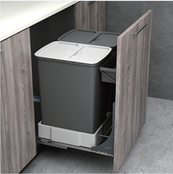
Soft Closing Waste Bin