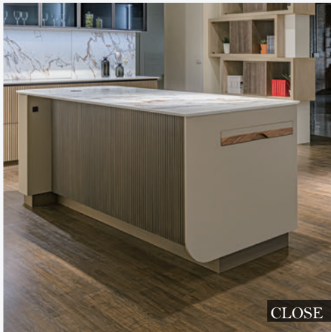
Cabinet extension table