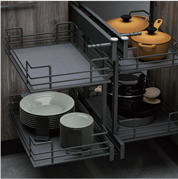
2-Way Soft Closing Magic Corner