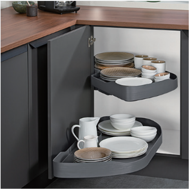
Ninka corner system -TRIGON