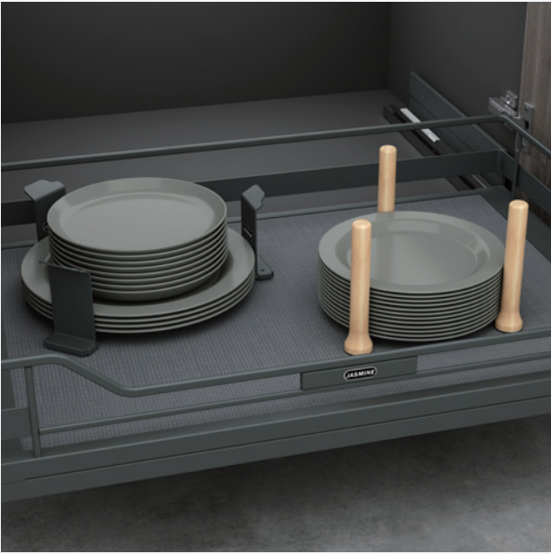
Magnetic Divider / Magnetic Bar Divider