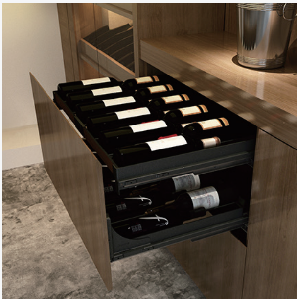
3-Sided Wine Pullout Basket